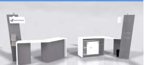
Sample image (Subject to modification. Stand November 2018)

IMPORTANT: The number of places is limited. Places will be issued on a first-come, first-served basis.